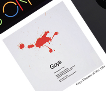
Goya Disasters of War, 1971