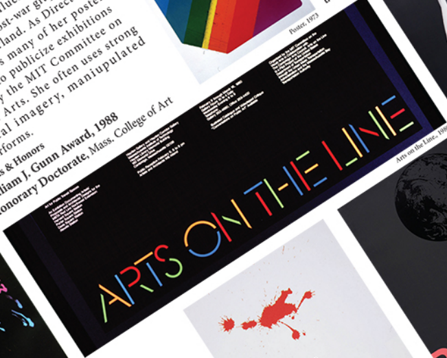
Arts on the Line, 1988